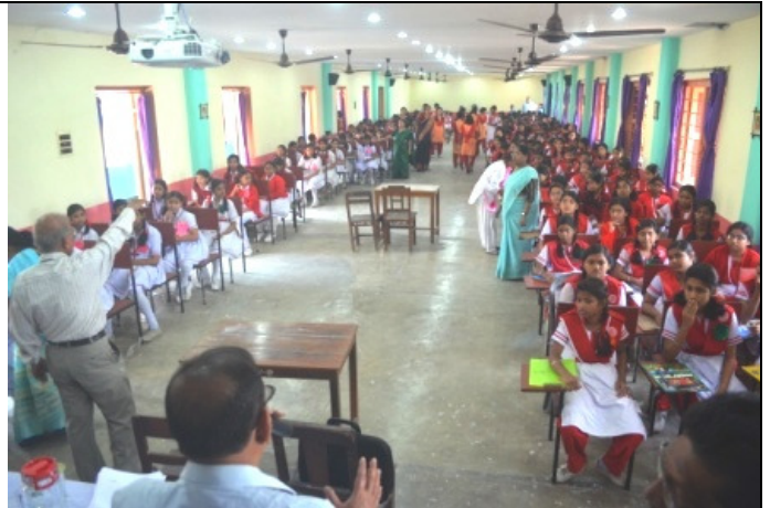
Health officer, and volunteers are also there to conduct the programme fruitfully.