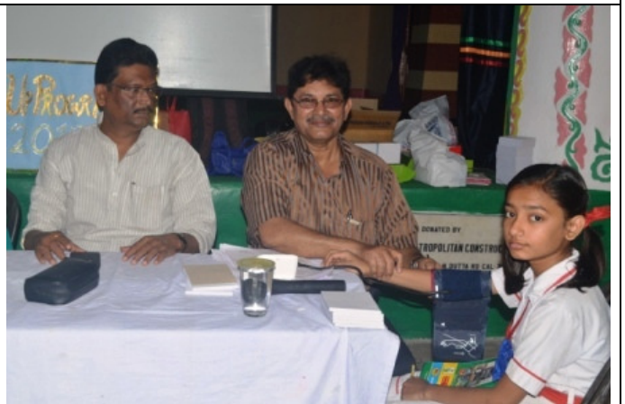
various medical tests being done by doctor.