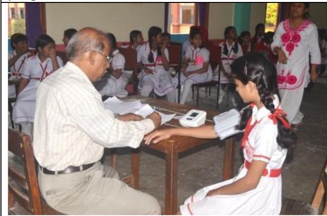
Doctor is measuring blood pressure of students.