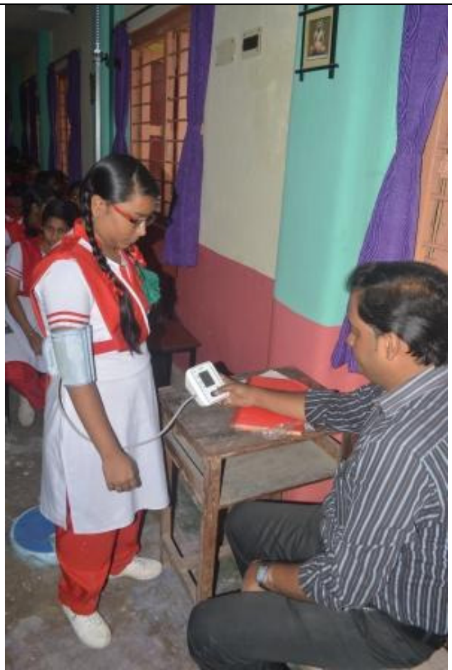
Student checks her blood pressure with the help of a health staff.