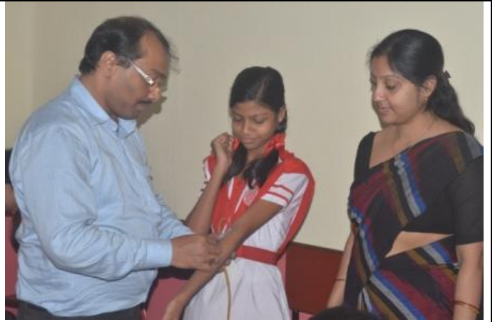
Doctor collects blood from a student for testing.