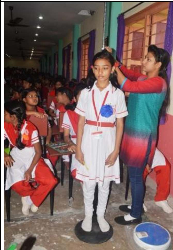
Height measurement of a student.